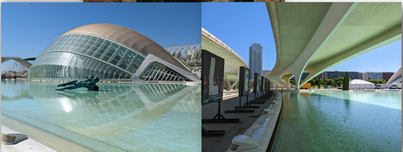
City of Arts and Science by Architect Antonio Calatrava in Valencia