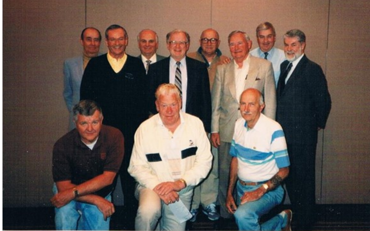
M-NCPPC Retirees Association Founding Members

members because we are CELEBRATING 30 YEARS together. We hope you can come and help us celebrate and even if you can't, we know you will be with us in spirit!