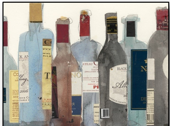
Wine & Spirit II